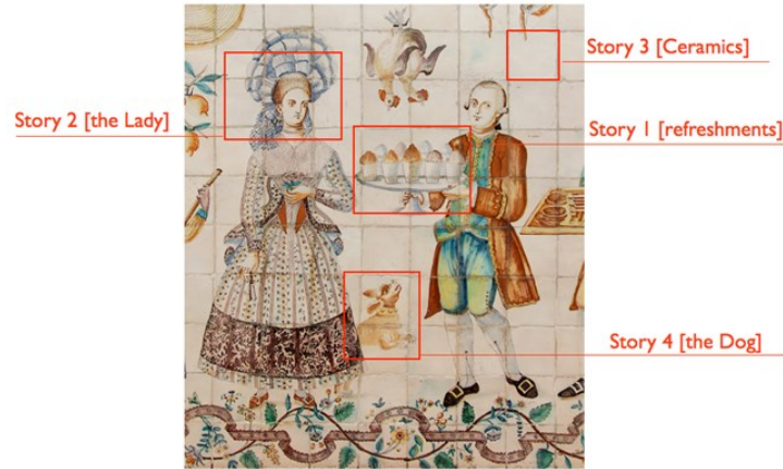
Figure 2. The stimulus image, highlighted sections correspond to the audio narration.