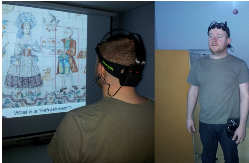
Figure 3. Participant wearing sensor hardware

Instruction about the experimental procedure was given and participants were asked to complete a consent form in accordance with the approval of the University Research Committee, and then fitted with a mobile pouch to hold the Nexus sensor hardware at the hip. Electrodes for ECG and SCL were placed on the torso and fingers, a Biosemi sensor cap was fitted to the participant to ensure correct sensor placement (see Table 1.) and electrodes attached. Participants were asked to stand in a relaxed position in front of the projection screen (shown in Figure 3.). This was followed by the audio-visual presentation of the Valencia kitchen.